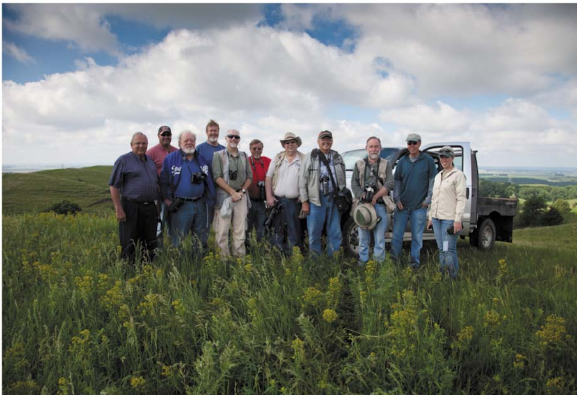
Nine members of the SCCC were able to get close-ups of the Broken Kettle Bison herd.