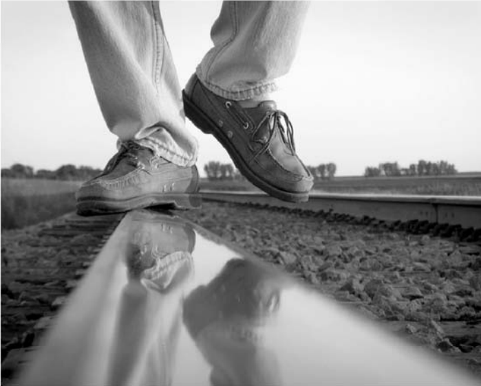
Balance Beam 1st Place B&W People