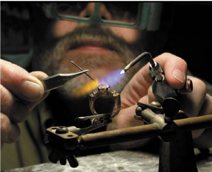
Goldsmith 3rd Place Downtown Places & Faces